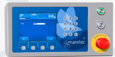
MARELEC Z2 Indicator

The machines are developed to be used in the most severe marine environment, and in this way accurate and fast weighing is always assured.